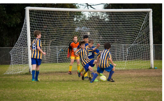
U12/5 enjoying the game and brilliant conditions at Oakleigh Oval last Saturday.